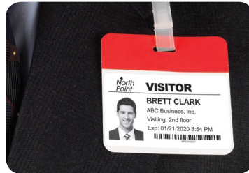
With Clip-On Back Piece*