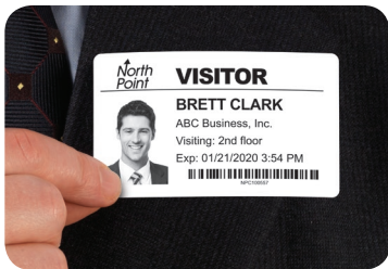
With Self-Adhesive Back Piece

Choose SELF ADHESIVE or CLIP-ON back pieces.